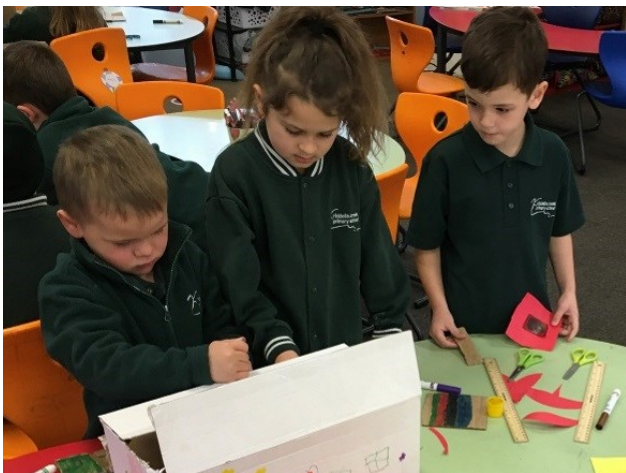
Measuring and constructing homes for our toys in BU2.